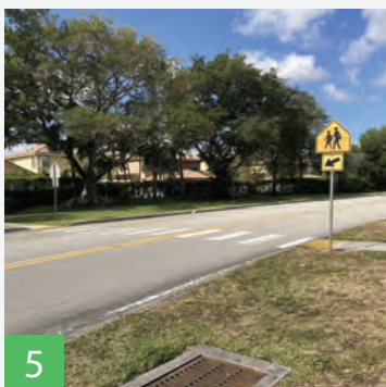
5 Add Rectangular Rapid Flashing Beacon (RRFB)