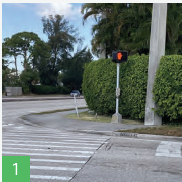
1 Upgrade pedestrian signal head to have a countdown