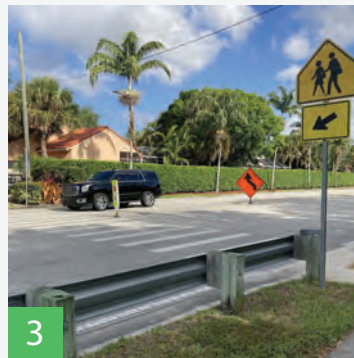
3 Add Rectangular Rapid Flashing Beacon (RRFB)