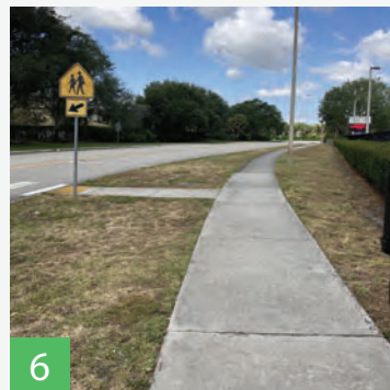
6 Widen sidewalk to shared use path