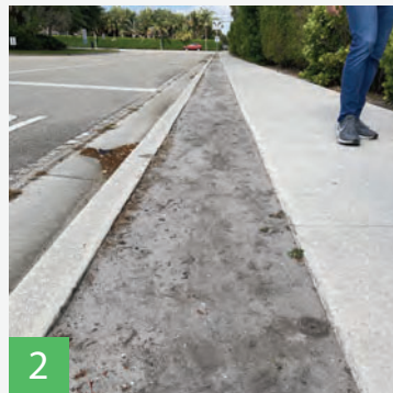
2 Widen sidewalk to shared use path or plant grass