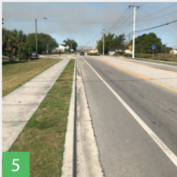
5 Paint existing bicycle lanes green for visibility