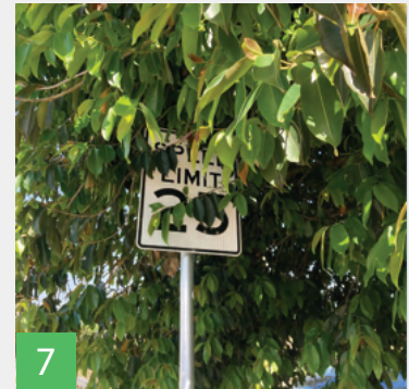
7 Trim overgrown landscaping to see signage

See interactive map of walking audit and findings at: PalmBeachTPA.org/WalkBikeAudits