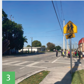
3 Install pedestrian-activated flashers at crossing sites