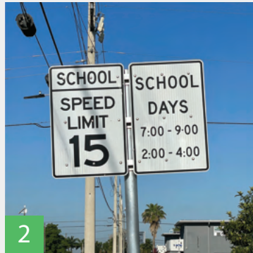
2 Upgrade signage to include school zone flashers