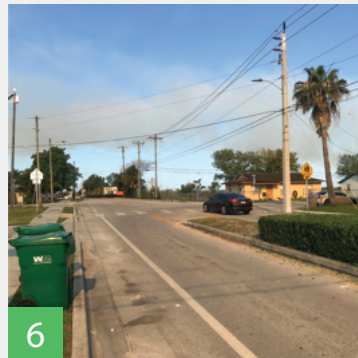
6 Install "No U-Turn" signage and extend median