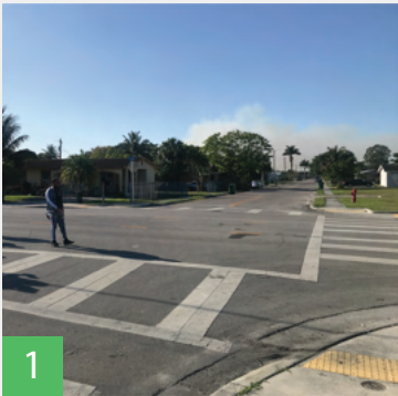
1 Install raised crosswalks as traffic calming measure