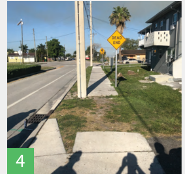
4 Connect broken link in sidewalk network